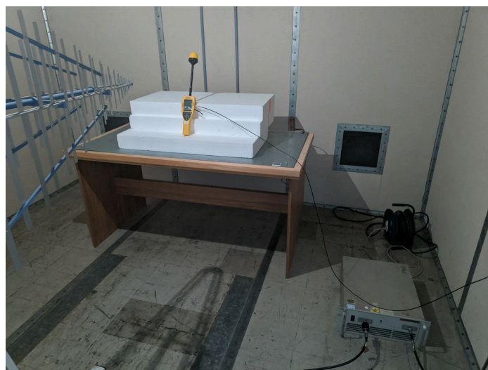
Fig. 1. Electric field strength measurement with electric field meter, transmitting Ultra log antenna.