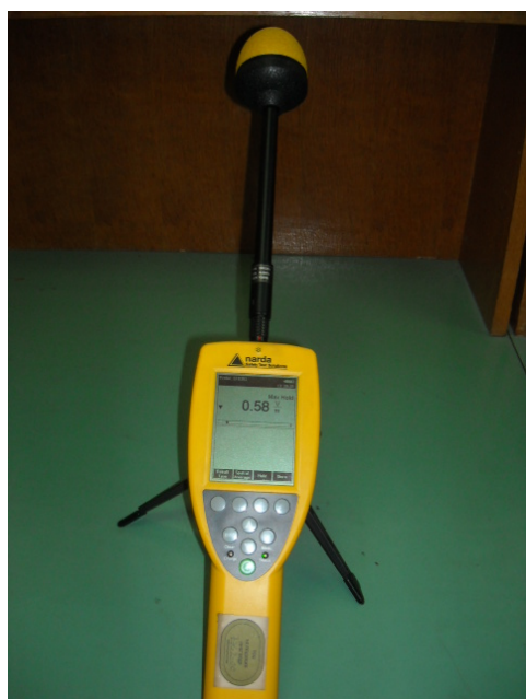
Fig. 2. NBM-550, „NARDA“ [6].

Intercomparison was performed by comparing the measured values of the electric field of different antennas (sensors) of EM field meters for the case when changing: