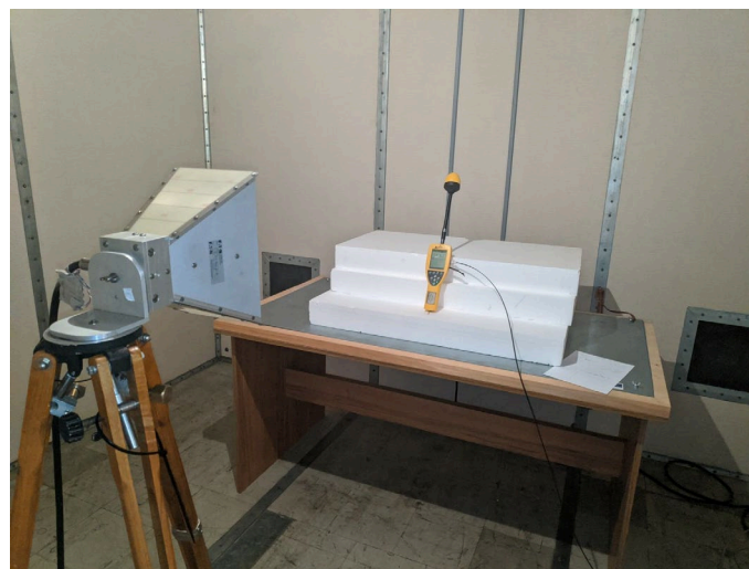
Fig. 3. Electric field strength measurement with electric field meter, double-ridge transmitting antenna.

EM field meters NBM-550, with its corresponding antenna (EF0391, EF6091 or EF5091), are mounted on a non-conductive styrofoam bracket mounted on a conductive table in a Faraday cage at a distance of 1.45 m from the transmitting antennas: Ultra log antennas (Fig. 1) or double-crest antennas (Fig. 3). The height of the transmitting antennas of 1.385 m corresponds to the height at which the antenna of the EM field meter is located.